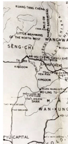
Map of Nan-Chao (8th & 9th Century)