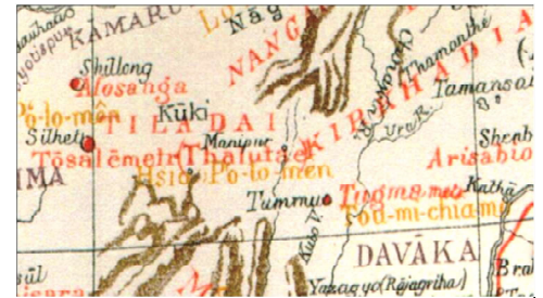
Synoptical Map of the early Greek and Latin, Indo, Arab and Chinese knowledge of Indo-China and the Indo-Malay Archipelago (1909)