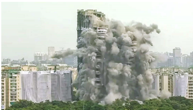
Agency Noida, August 28:

Supertech's twin towers in Uttar Pradesh's Noida were finally demolished at 2.30pm on Sunday, ending the nine-year saga. The demolition of the Apex (32 storeys) and Ceyane (29 storeys) towers would leave behind approximately 35,000 cubic metres of debris that would take at least three months to be cleared.