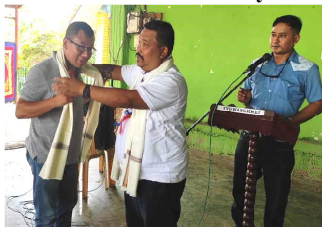
IT News Imphal, August 28:

X-fitness gym Wangkhei had celebrated its 12th foundation day at the YVO community hall in Wangkhei today. On the occasion body builders who participated in the Mr. Manipur and Mr. Khamba contests and those people who had extended monetary support for the de-